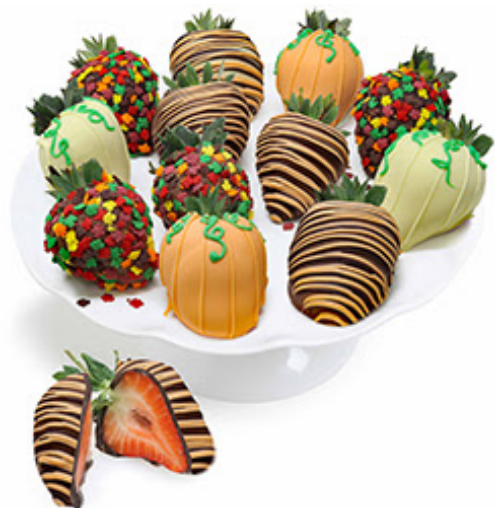
CHOCOLATE TREATS SHOP NOW