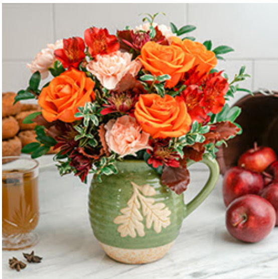
THANKSGIVING BOUQUETS SHOP NOW