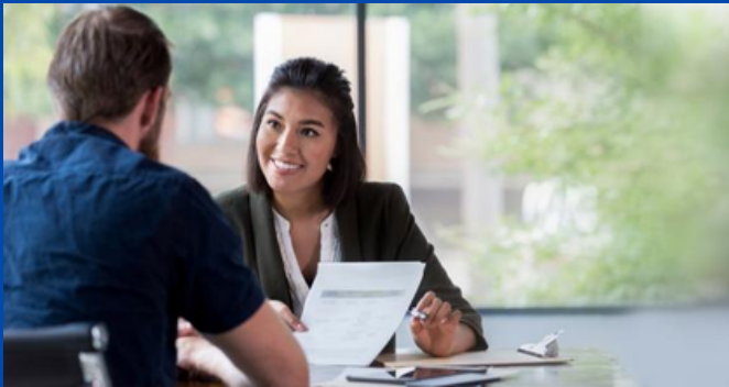
Bankruptcy Counseling Fee Waiver