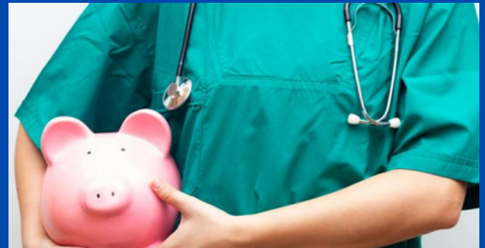
Medical Bill Negotiating Service