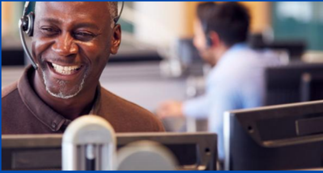
Save My Home Hotline