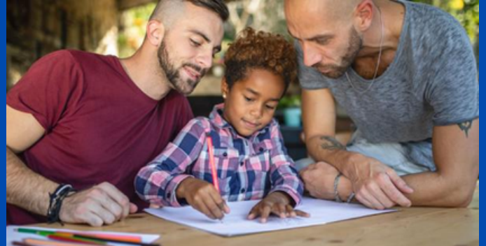
Disaster Relief Grants