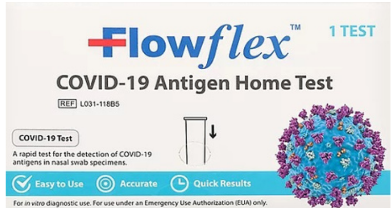
Flowflex COVID-19 Antigen Home Test

Please check the expiration dates and updated shelf life of the tests that you do have and will receive