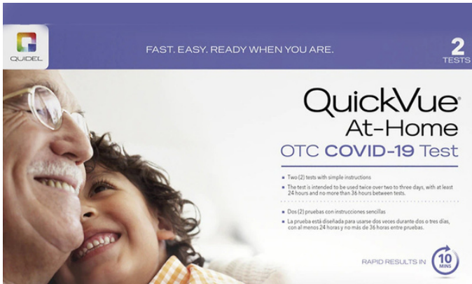
QuickVue At-Home OTC COVID-19 Test