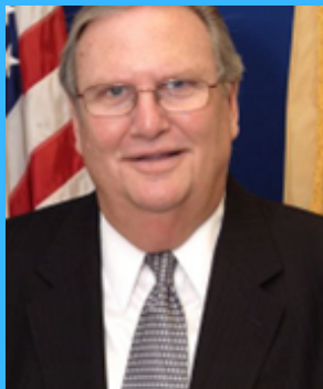
NTU HALL OF FAME RECIPIENT