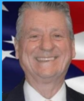
NTU LEGACY AWARD RECIPIENT POSTHUMOUSLY