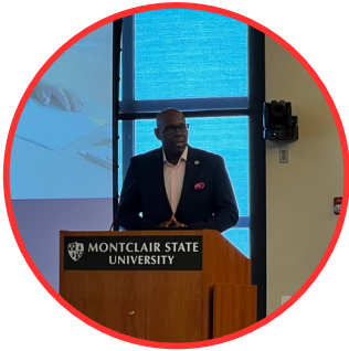
NJ Senator Troy Singleton (D) Majority Whip - District 7